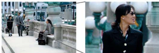
30X optical zoom